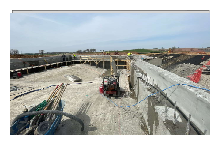
Second half of lap pool walls poured