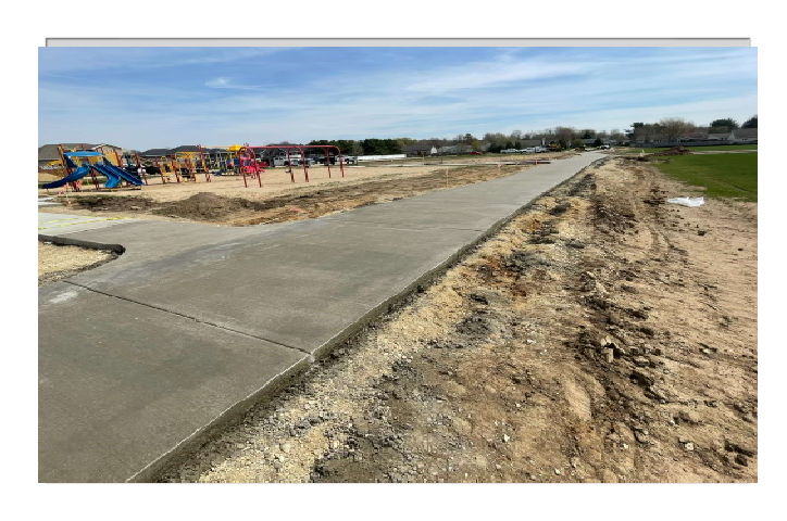
10' walk being poured on East side of park