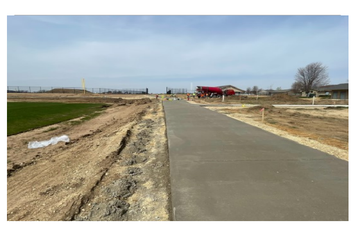
10' walk being poured on East side of park