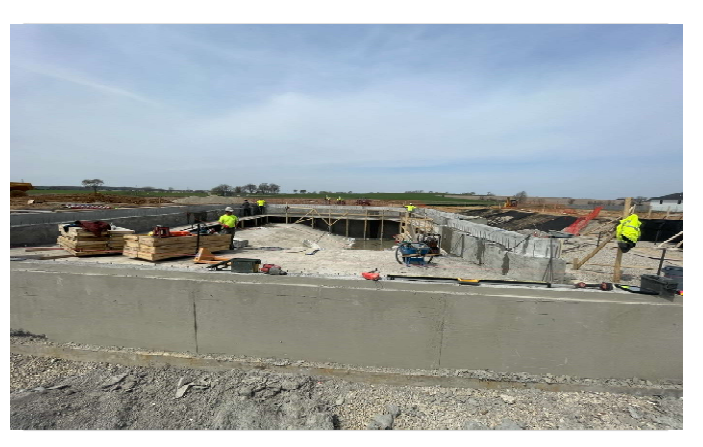
Second half of lap pool walls poured