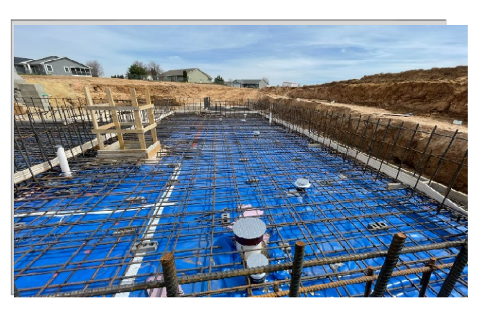
Pump area of equipment building foam, vapor barrier, rebar and floor drains installed